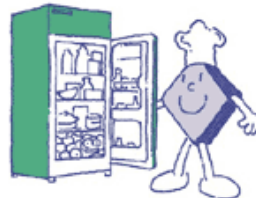
5. Keep hot food hot and cold food cold