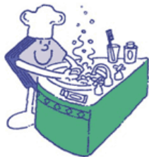
1. Keep hands and nails clean