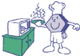
4. Cook high-risk foods thoroughly