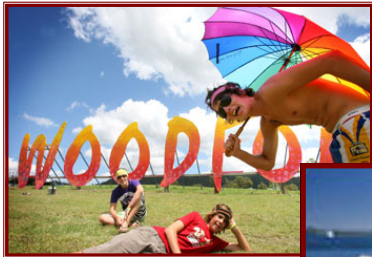
Woodford folk festival attracts thousands of national and international visitors every year!