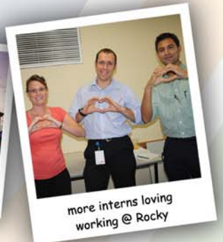
more interns loving working @ Rocky