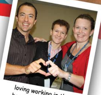
loving working in the heart of Queensland!