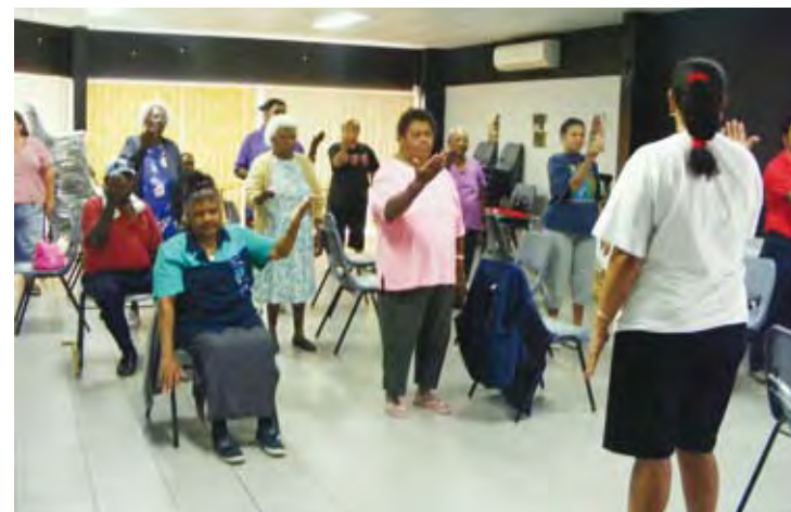
Tai chi helping to alleviate chronic disease.

"The activities will increase people's awareness of the importance of good nutrition and incorporate Queensland Health's Go for 2&5 message as part of our local Food Outback fruit and vegetable promotions," she said.