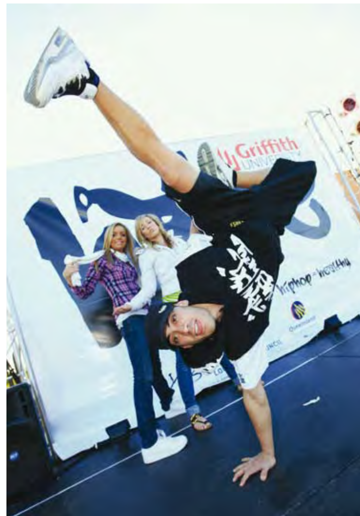
Getting his balance right . . . a dancer shows off his technique.