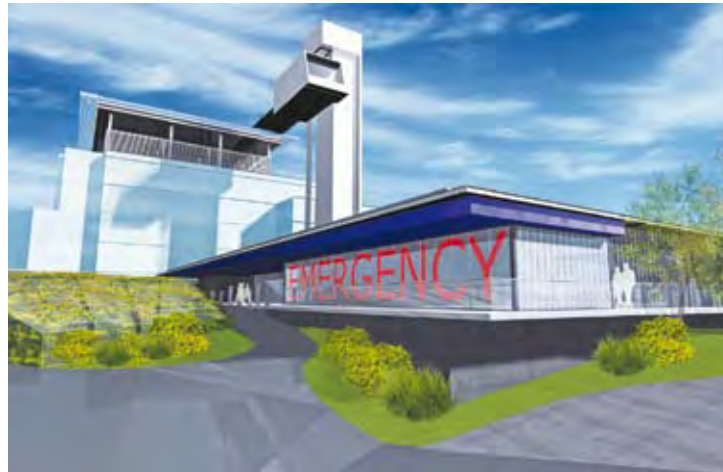
An artist's impression of the extended emergency department.

The foundation strength is planned to allow additional floors to be added to the extension over the next 20 years.