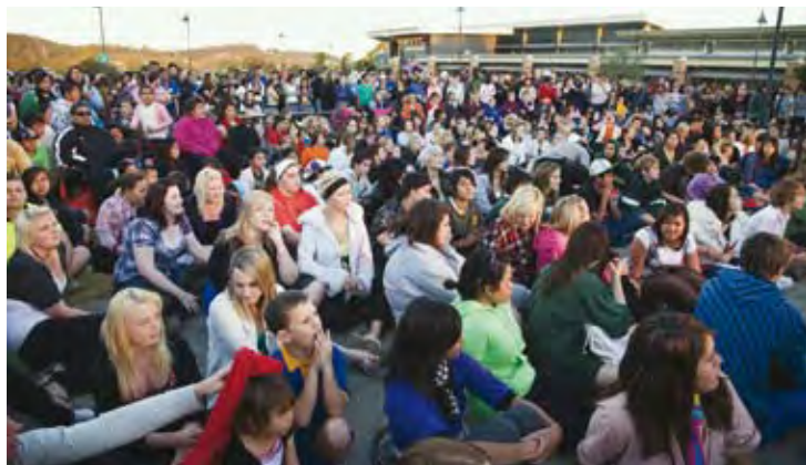
A section of the crowd during the HYPE competition.

"The talent identification program was established after the 2007 pilot project to support enthusiastic and talented young dancers to obtain potential employment opportunities through dance."