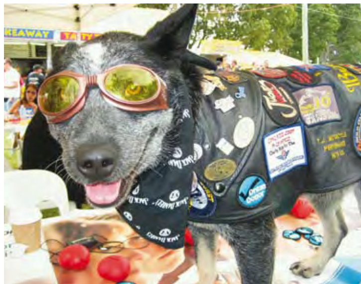
Bundy the cattle dog: proud to promote organ donation.