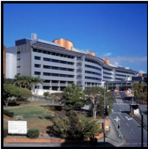
Princess Alexander Hospital