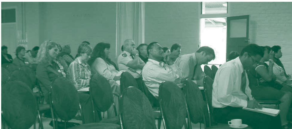
Samoan interagency forum - 9th May 2005

For further information please contact Faalolo_Kurene@health.qld.gov.au .