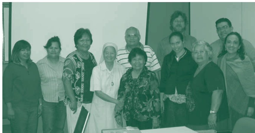
Community leaders meeting, March 2006

The community development component of the model is also being implemented by holding very successful discussion sessions with leaders of CALD communities as they are often the first point of contact for individuals and families experiencing mental health problems.