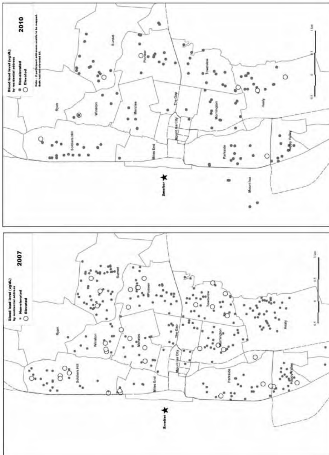
Figure 3: Domestic locations in Mount Isa of children in the 2007 and 2010 studies with blood lead levels of less than 10µg/dl and those with blood lead levels equal to or greater than 10µg/dl