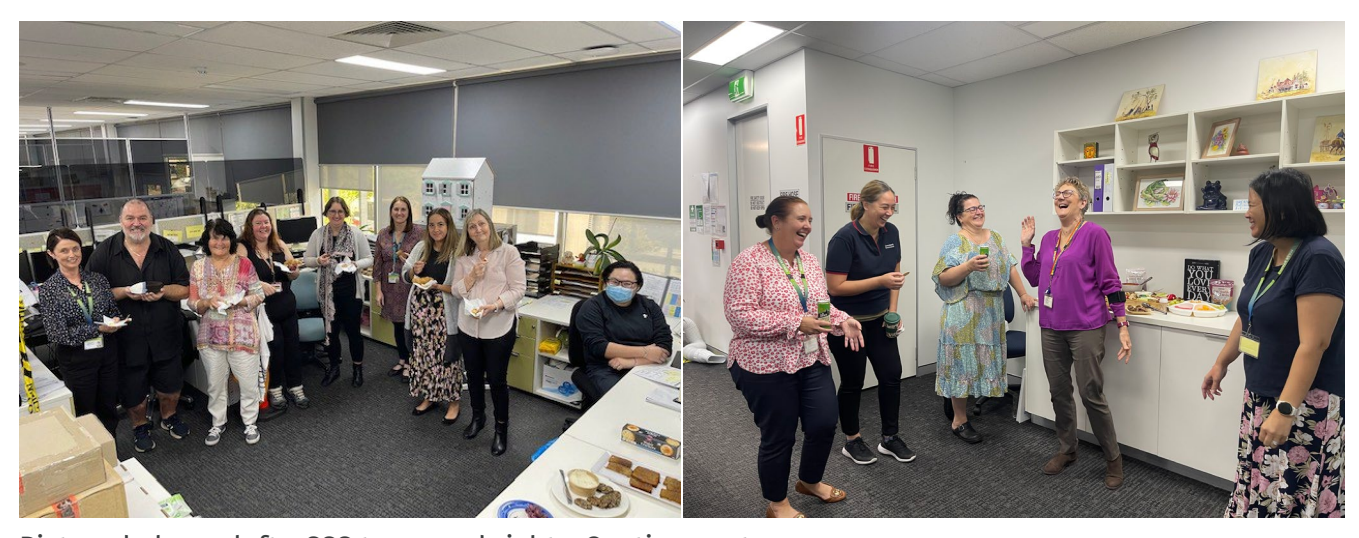
Pictured above, left - SSS team and right - Continence team:

Day 10: Healthy Morning Tea – A Successful 2 weeks of intentionally seeking wellness calls for celebration the only way the teams know how – a plethora of food.