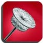
One type of Septal Occluder

A Septal Occluder is passed into the fine tube and advanced through your heart and put into the hole.