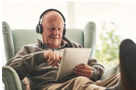
tablet used with wireless headphones