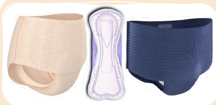
Throw away pads and pants

Products to help if you have bowel or bladder problems and to keep you, your bed or chair dry.