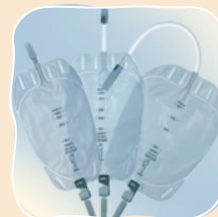
Catheters and leg bags