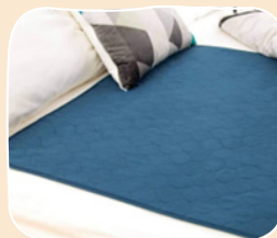
Bed and chair pads