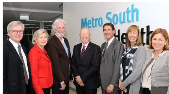
Metro South Hospital and Health Board members