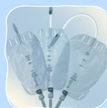
Catheters and leg bags