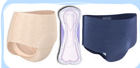
Throw away pads and pants

Products to help if you have bowel or bladder problems and to keep you, your bed or chair dry.