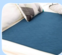
Bed and chair pads