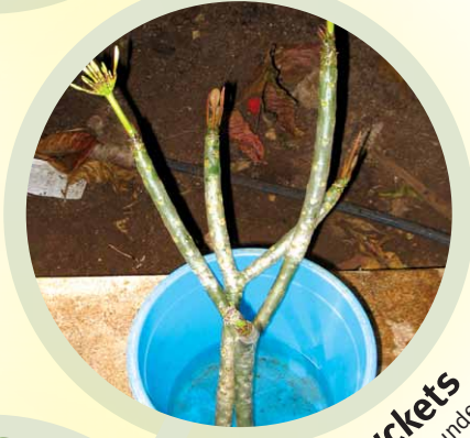
Empty buckets Store upside down or under cover