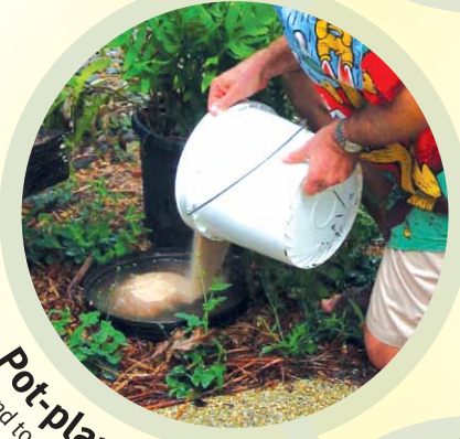
Pot-plant bases Fill with sand to stop water collecting