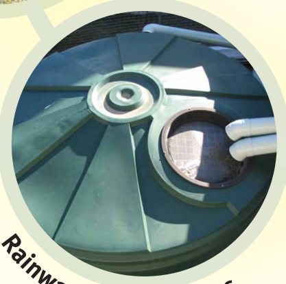
Rainwater tank screens Replace if missing or broken