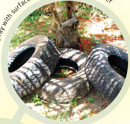
Loose tyres Spray with surface spray and store undercover