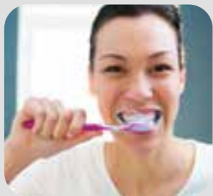
fufulu nifo brush teeth