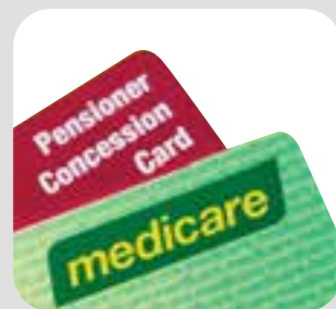
pepa mo le va'aiga o le soifua maloloina/pepa mo pa'u e maua Medicare/concession card