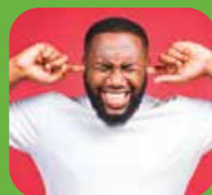
leo tele na'uā too loud