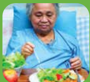
fia 'ai hungry