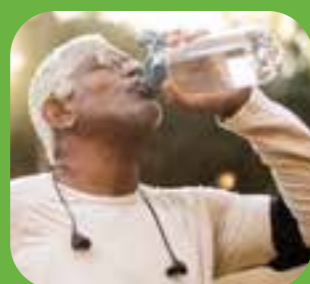
fia inu thirsty