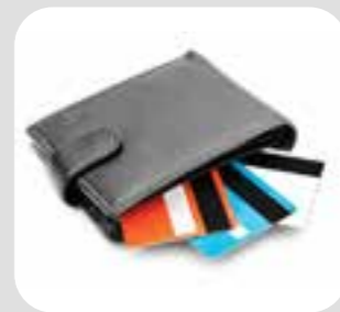
'ato tu'u tupe/ 'ato tupe wallet/purse