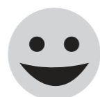
faaoso fiafia excited