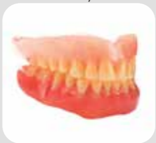
Tainifo faapipii dentures