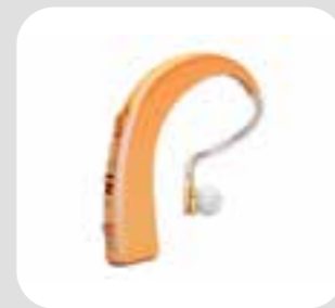
mea e fesoasoani i le fa'alogo hearing aid