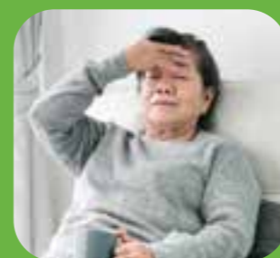
tigā le ulu headache