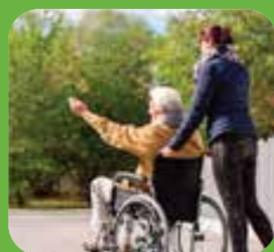
alu i fafo go outside