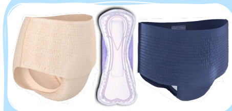
Throw away pads and pants

Products to help if you have bowel or bladder problems and to keep you, your bed or chair dry.