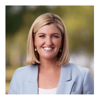
Hon Shannon Fentiman MP

Minister for Health, Mental Health and Ambulance Services and Minister for Women