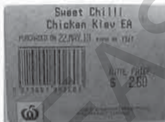
Sticker applied to pack

Ingham's wishes to advise customers it is conducting a recall on its sweet chilli kiev.