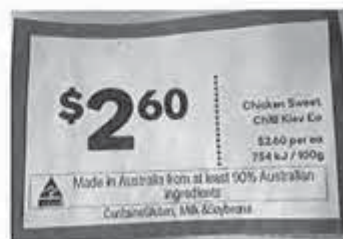
Deli Ticket on display

Purchased from the deli counter only on 19, 20 and 21 of May 2019