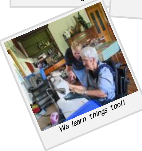
We learn things too!!