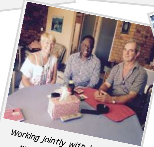
Working jointly with local health professionals and clients ...