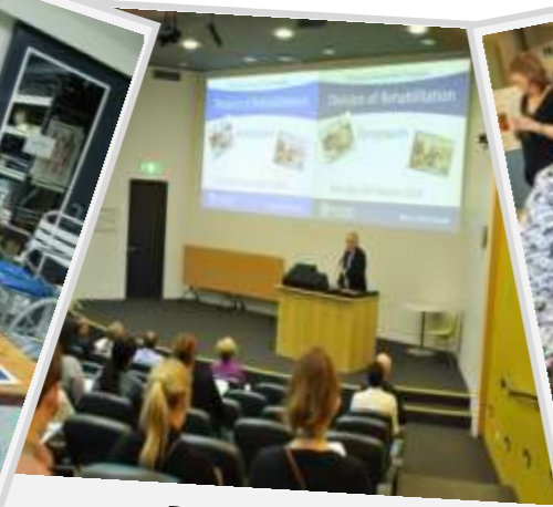
Research symposium Keeping us up to date