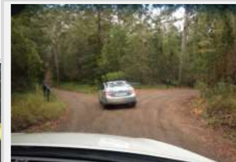
SPOT travels thousands of kilometres to all corners of Queensland to assist people with SCI, their families and local service providers