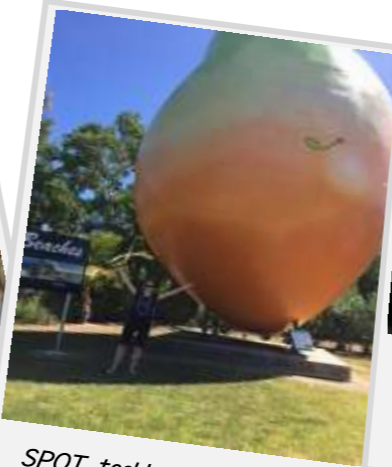
SPOT tackles the big issues