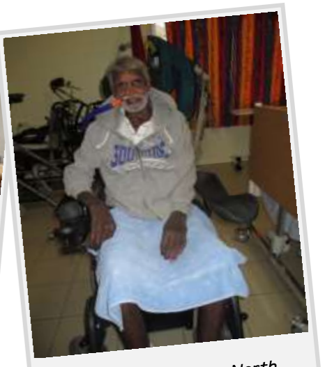
Back home in North Queensland