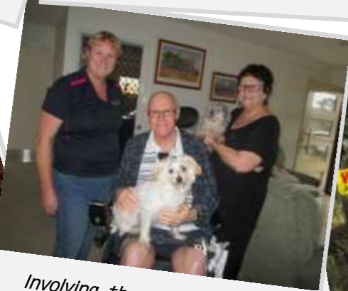
Involving the whole family in consultations