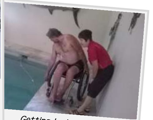
Getting back to health and fitness