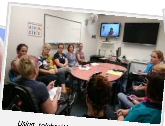
Using telehealth to connect with other professionals around Queensland