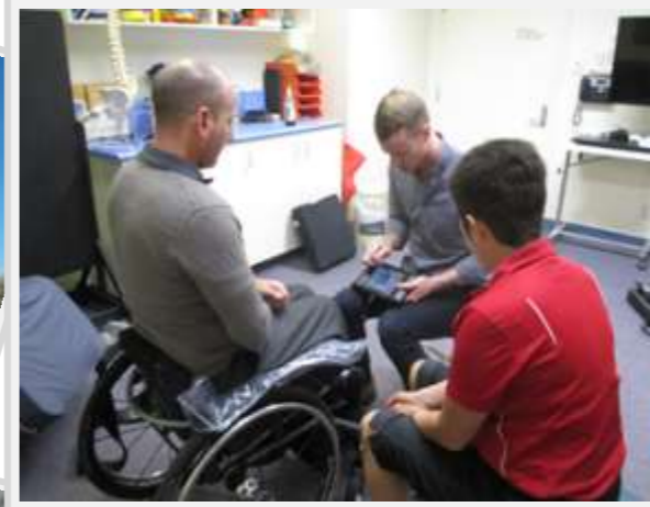
Working with rehabilitation engineers for custom seating solutions