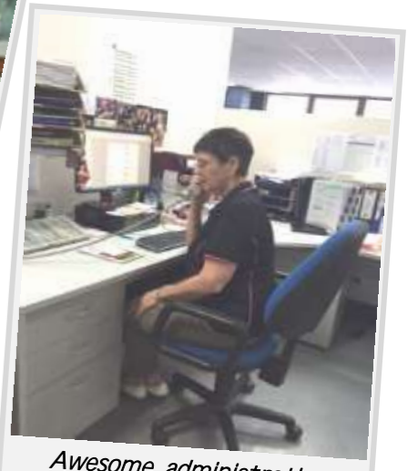
Awesome administration staff