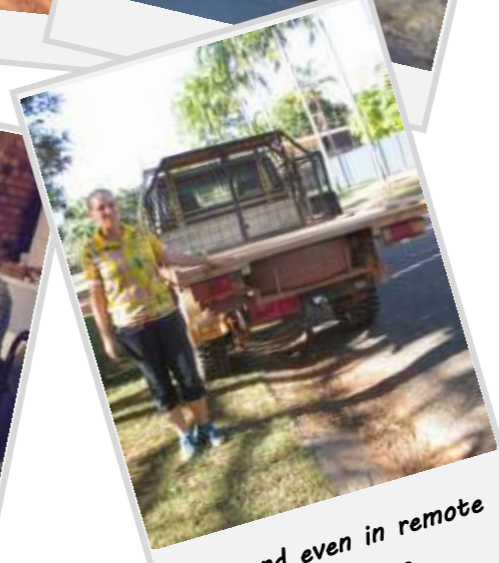
... and even in remote locations