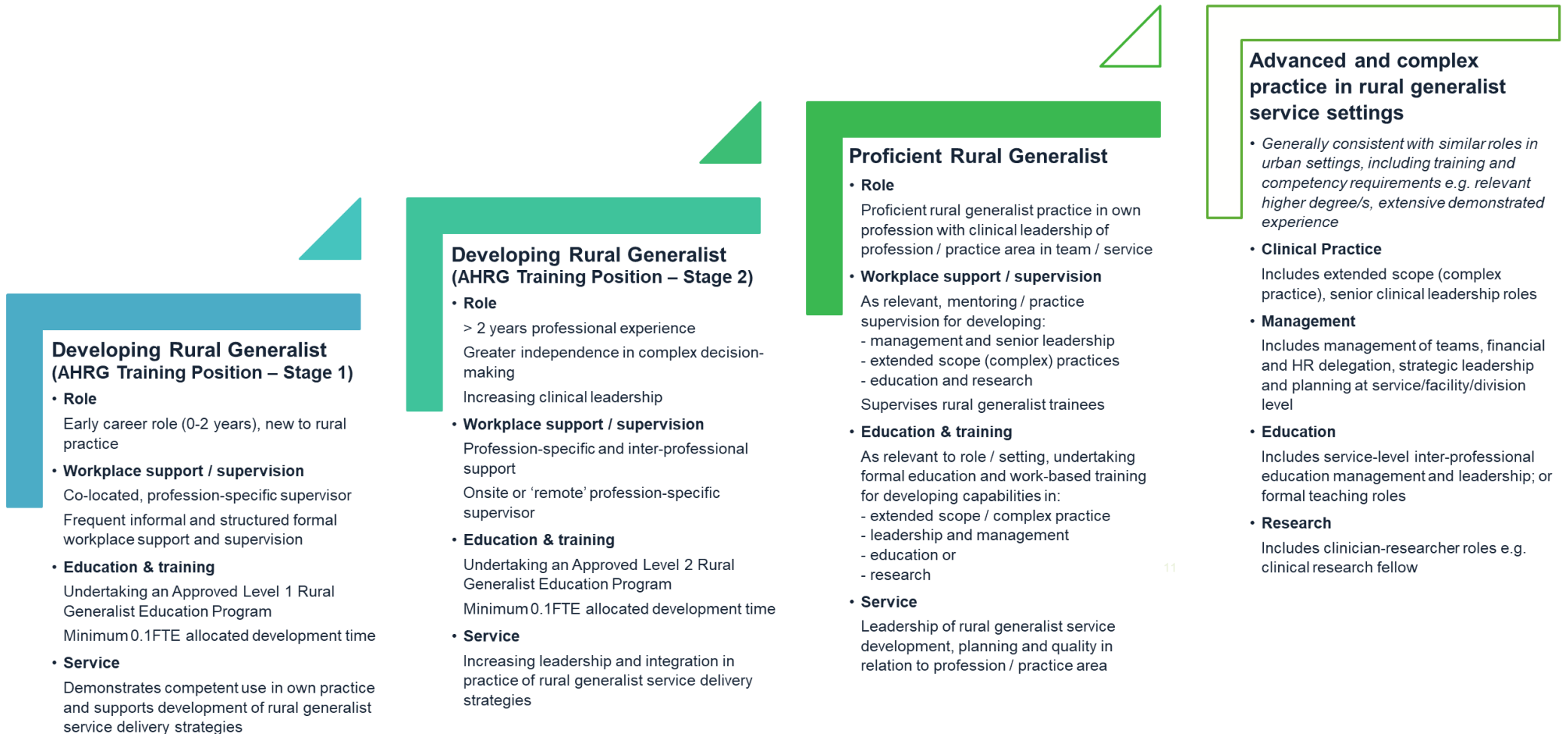
Figure 1 Allied health rural generalist roles and development